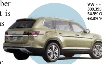
US MADE VW ATLAS | 5,154 US NOV. SALES 3RD BEST SELLING VW GROUP LIGHT TRUCK IN NOVEMBER