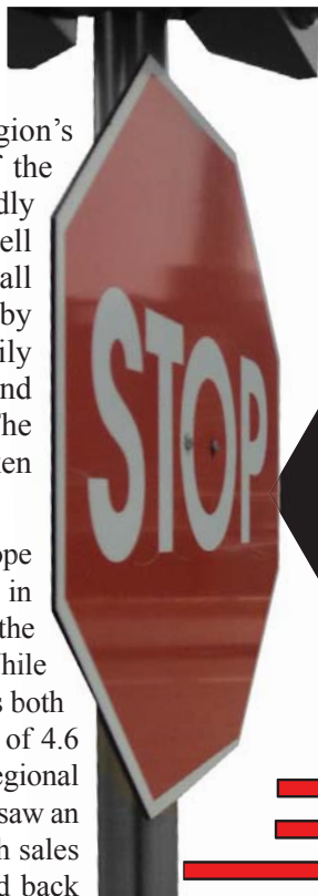
WESTERN EUROPE APRIL 2017 YOY MONTHLY CAR SALES AID Graph 17/66

April's new car sales in Western Europe were hit by three fewer working days in many markets. Accordingly, all but one of the region's major markets posted declines. While Spain saw a minor 1.1 per cent uplift in sales both Italy and France saw minor respective falls of 4.6 and 6 per cent. The UK, the long-running regional car sales dynamo, was hardest hit. Germany saw an 8 per cent dip in April sales, but same month sales in the UK slumped by nearly a fifth, pulled back